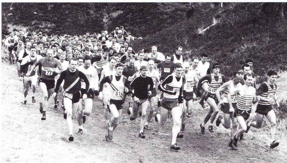
537 runners seeing out the old year.